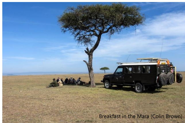
Breakfast in the Mara (Colin Brown)

We use customised 4WD Land Cruisers on this holiday each holding 6 people. These vehicles will be used for transfers between lodges and game drives into the Maasai Mara. They have excellent visibility, an opening 'pop-top' and all group members will have access to a window seat. Please note that game viewing can be disrupted if there is heavy rain.