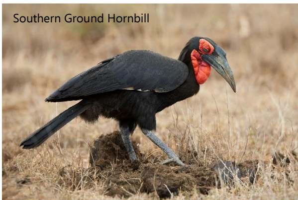
Southern Ground Hornbill

Coursers, Wattled Lapwing, Rosy-breasted Longclaw, Yellow-shouldered Widowbird and Capped Wheatear. Lone bushes or dead trees provide lookout perches for a variety of bee-eaters and rollers, including the beautiful Northern Carmine Bee-eater, whilst above them soar Martial Eagles, Lappet-faced, African White-backed, Hooded and Ruppell's Vultures, the latter four always on the look out for a recent kill.