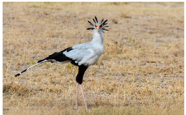
From top: Lions, Blue Wildebeest and Secretarybird